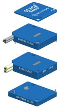
SLICE NANO Stack Cover

Offered in 3-channel increments, the SLICE NANO system is easily distributed within the crash dummy, maximizing testing potential and reducing test set-up time. It is also the most cost effective solution for new dummy purchases as well as retrofitting existing dummies because all existing sensors plug seamlessly into the SLICE NANO unit.