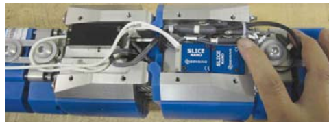
12 channels of SLICE NANO™ installed in Flex pedestrian leg

Flex Pedestrian Leg – DTS partnered with Humanetics Innovative Solutions to integrate the SLICE NANO miniature data acquisition system. The Flex leg is fired at 40 km/hr from a launcher or used in full-scale vehicle tests. Several accessory products have also been created to support unique testing requirements in Asia and North America.